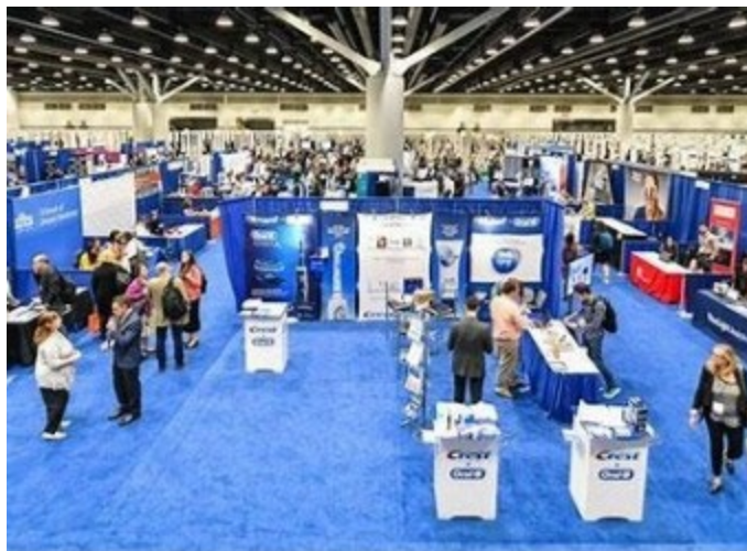
Exhibit Dates and Rates:

Exhibit hall booth reservations are now open! Capitalize on networking opportunities and promote your company's latest advances to key thought leaders, researchers in the field, potential employees, students, and future researchers.