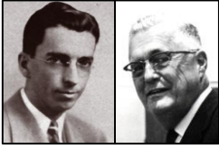
Peyton-Skinner Award for Innovation in Dental Materials