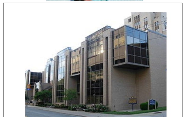
University of Pittsburgh Dental School