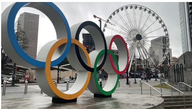
Image of Olympic Park in Atlanta, GA

Thank you to everyone that participated on-site and virtually for the meeting in Atlanta. For this meeting our group accepted 64 of 68 submitted abstracts for presentation. In addition, we sponsored or co-sponsored 4 Symposia, 6 On-site Interactive Talk sessions, and 3 Completely Virtual Interactive Talk Session at this meeting.