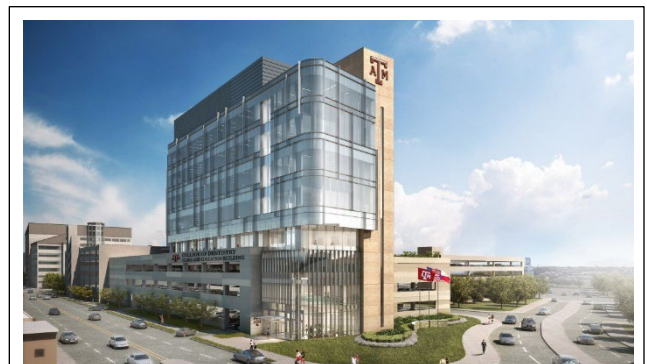
Texas A&M Dental School